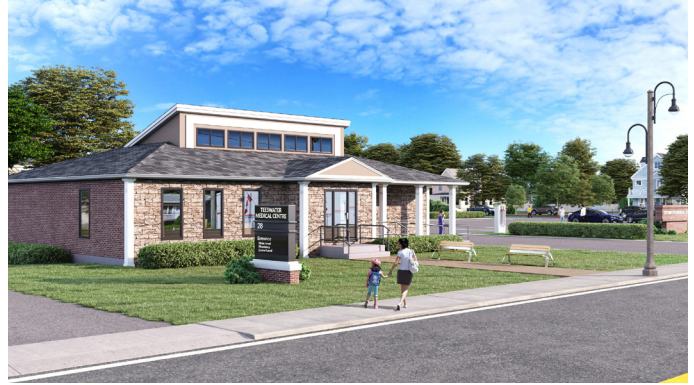
Artist concept of Teeswater Medical Centre

I am also pleased that South Bruce is benefitting from our participation in the DGR site-selection process. These financial investments recognize our contribution to help Canada find a location for the long-term management of used nuclear fuel. We